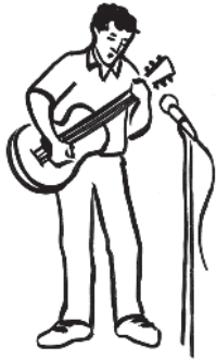
Someone playing a musical instrument