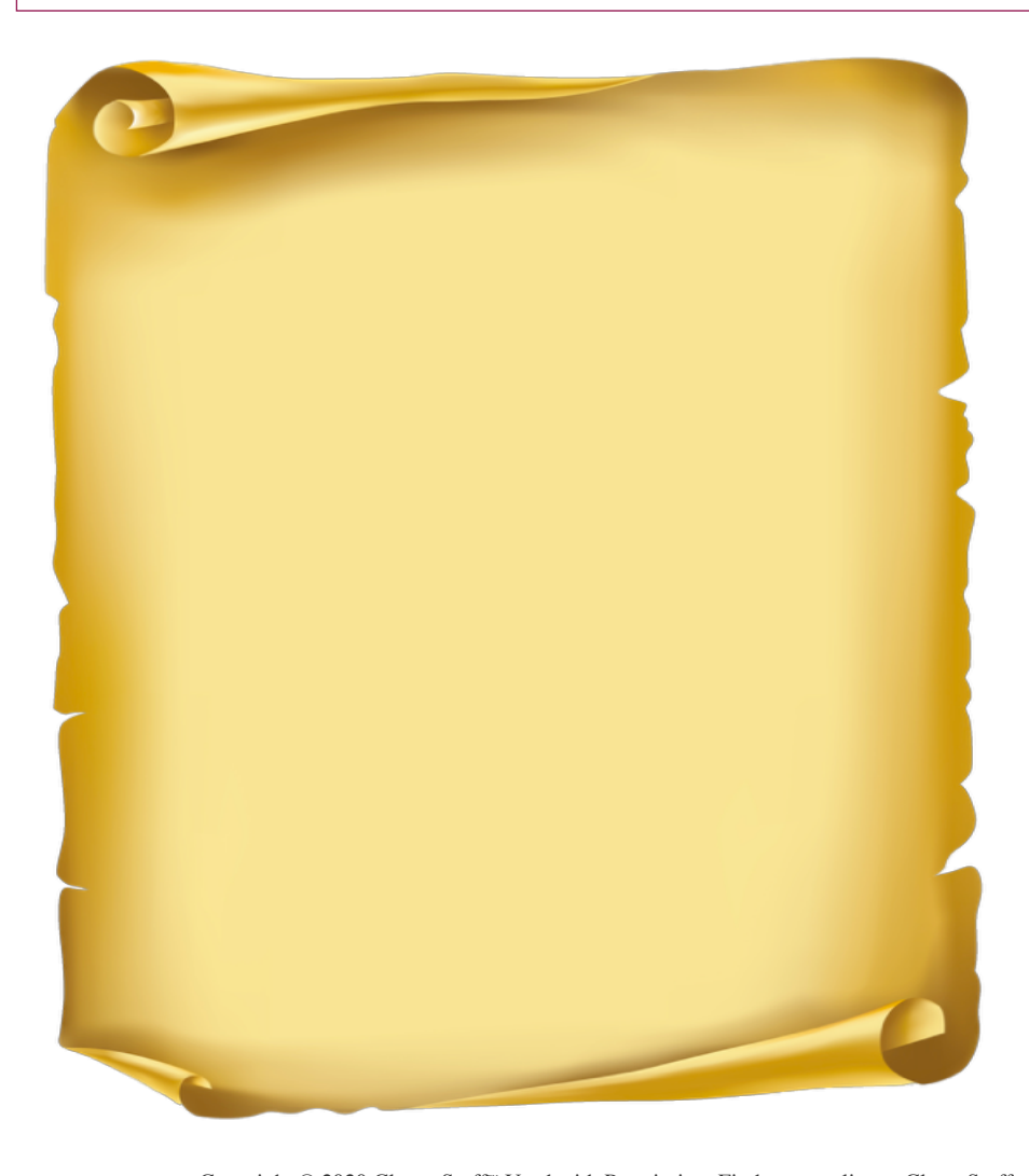
Copyright © 2020 Clergy Stuff<sup>™</sup>. Used with Permission. Find more online at ClergyStuff.com.

Draw a picture or write a story on the scroll about a time when you shared a great story with a friend.