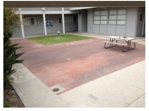
Help turn this into that.

Bring your family and friends. I will be holding a pancake breakfast to help raise money for the construction of my Eagle Scout Project. My project is to modify the Christ Lutheran Church courtyard to have better drainage, and I will install a prayer labyrinth above it. Donations are appreciated and will go to support my Eagle Scout Project